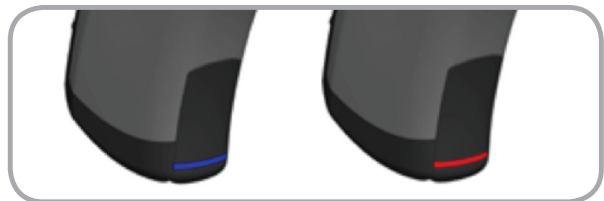
Figure 5: 3 Series RIC right and left indicators.

A common request from professionals and patients is easy access to right and left hearing aid identification. Both 3 Series products include external indicators that are easily installed at the time of fitting (Figure 5). The RIC 312 also incorporates a second identification method, as there are also red and blue tips on the receiver cables.