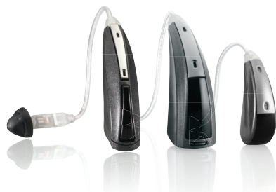
Figure 1: (from left to right) Zōn RIC 312, Wi Series RIC 13, X Series (Xino™) RIC 10

2012 brings a family of completely redesigned products to Starkey Hearing Technologies' portfolio. These new products, known as 3 Series, were designed with input from both professionals and patients. Focal points of the new design strategy included new receiver cables, power-dome earbuds, user controls and easily seen right/left hearing aid identifiers.