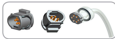
Figure 2: 3 Series RIC SnapFit cable and connector.

The new SnapFit receiver cable connects to the hearing aid via a six-pin connector, looks smaller due to a 60-percent reduction in the connector protruding from the hearing aid case, and uses a new polymer allowing for thinner wall sections, ultimately making the receiver tube 25 percent smaller in diameter. In addition, the new tubing material offers better optical clarity and chemical resistance, which minimizes discoloration or clouding. The SnapFit design creates a stable connection between the hearing aid and cable that resists breakage and loss of electrical connection caused by everyday wiggles, twists and pulls (Figure 2). With “forward engineering” in mind, the SnapFit receiver cable was not only designed to interface with current technology, but also to allow for the integration of technologies that may be available two to three years from now.