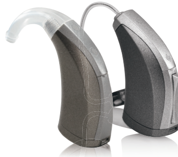
Figure 4: 3 Series switchless mini BTE and RIC 312 with switch.

switch” design emerged. It offers a stable tactile “feel” and provides volume and memory control customization for each patient. For those patients who prefer to use a remote control or simply prefer the sleek design of not having a “rocker switch,” switchless versions of both the 312 RIC and 312 mini BTE 3 Series products are available (Figure 4).