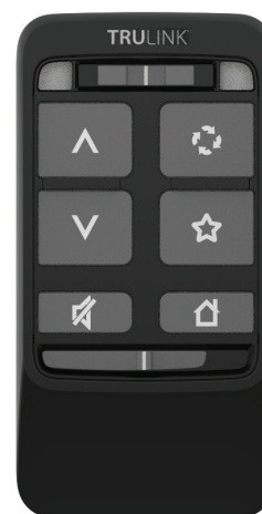
Advanced Remote Control