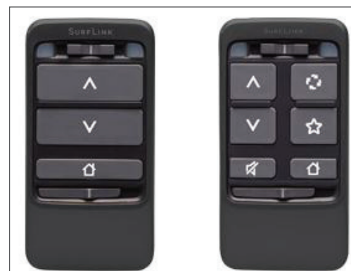
Basic (left) and Advanced (right)