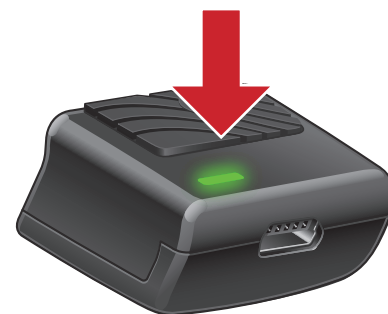
Power On (green)