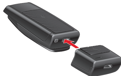
Connect SurfLink Remote Microphone 2 and SurfLink Mini Mobile