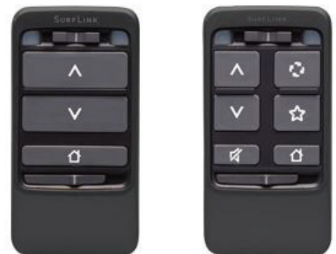
Basic (left) and Advanced (right)