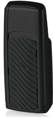
Focus (directional) Mode