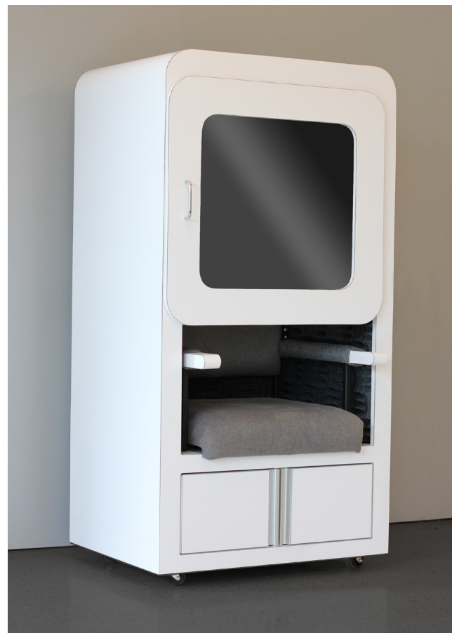
PSE with right-hand hinge configuration shown

Let the PSE's enhanced comfort and highly accurate testing environment provide you with the right combination of features for your sound control and evaluation needs.