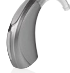
mini BTE 312